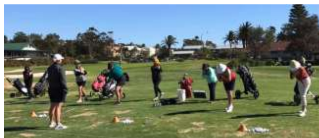
Ladies on the range with our coaches