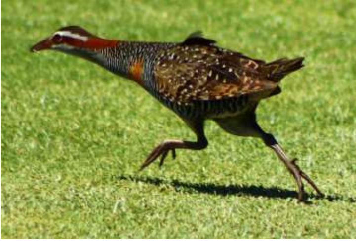
Buff banded rail scuttling in front of the 5th green.