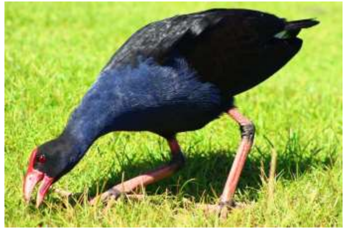
Purple swamp hen.