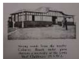
Club House late 20's

What a difference the opening of the Harbour Bridge would make to members travelling from the city, but the Club was still very much a part of the weekender and holiday scene. In the summer of 1931-32, this use of the course idea could only have helped. “A new and much appreciated innovation is the regulation permitting visitors to play at all times without restrictions.” We can't begin to compare February 2018 with the February of 1932!