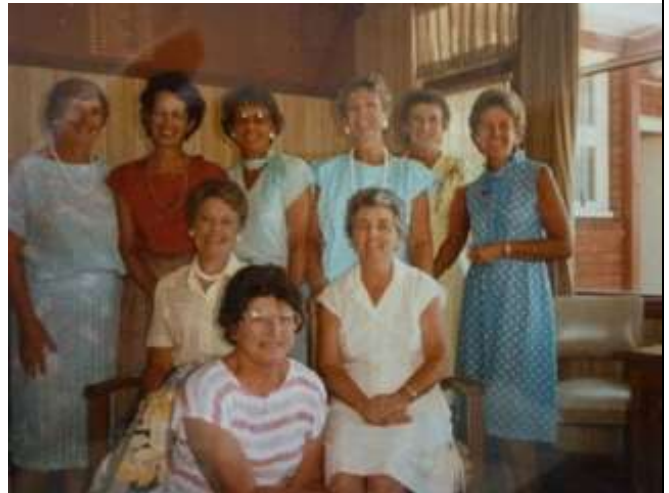
The 1986 Committee