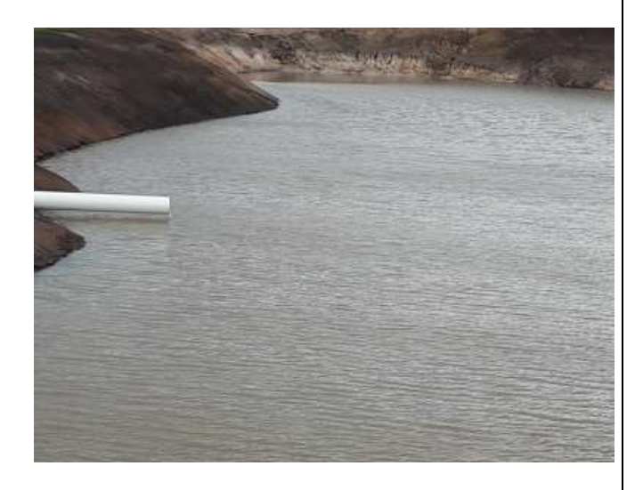
Pond filling up through 'balance pipe' from 5<sup>th</sup>

The torrential downpour on Monday night swept away some of the new turf. The boys spent Tuesday and Wednesday repairing the damage.