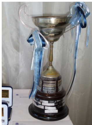
The Weekend Associates Premiership Trophy.